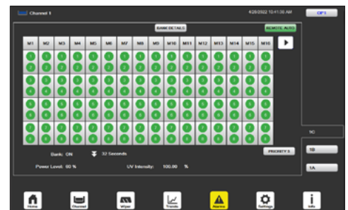
The Bank Overview screen shows you the status of each bank of lamps.