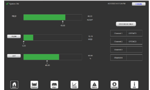
The Home screen provides an at-a-glance view of overall system status.